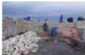
Alsayidia Police Station Iraq / Baghdad