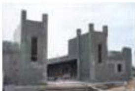
Security Barriers Affairs Center