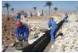
Aldiwaniya police station