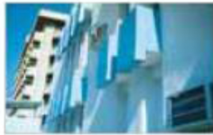
Alamin Police Station Iraq / Baghdad